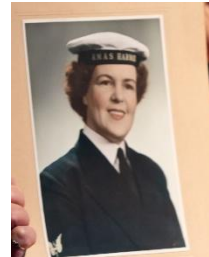
Who is she??