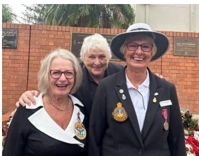
Attending the Victory in Europe commemoration at New Farm on 10 May.

On 14 May 1943, the 2/3rd Australian Hospital Ship (AHS) Centaur was en route from Sydney to Cairns when she was sunk by a Japanese submarine south of Moreton Island, off the Queensland coast. From the 332 people on board, only 64 survived.