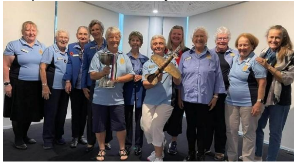
The 2025 winners – Air Force

April 12 - It was that time of year again. Time to have a fun time, eat a great meal, win some raffles, and get our singing voices ready. As Navy won the previous year, they were first to strut their stuff. After a great rendition, we thought that we may have had it in the bag. However, we had to wait for the other two services to produce their efforts. Finally, all three had sung their song and we awaited in bated breath to see who the judges deemed to be the winner. Congratulations to the Air Force ladies who won the cup. Oh well! There is next year..