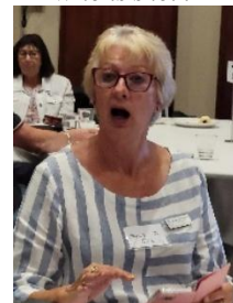
Yes 'Alice', it is over for 2025!! See you all in Canberra in July 2027 – Keep Safe.