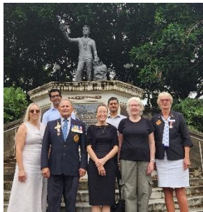
NAA(Q) State President & NWQld President with guests