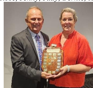
NWQ's Secretary accepting the Sunshine Coast Shield from the State President.