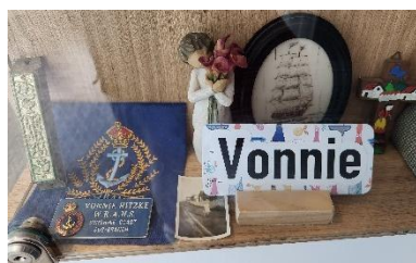
Visit to Vonnie Hitzke