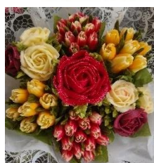
Roses for the Gold Coast Ladies