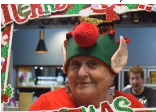
Christmas Pixie (Santa Helper)