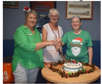
Secretary, President & Treasurer