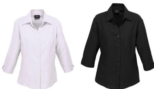
BIZ OASIS button front SHIRT with EMBROIDERY on right side

Ribbons are worn during the day for non-Ceremonial events.