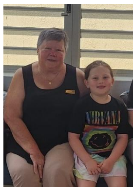
Grandchildren on Gold Coast