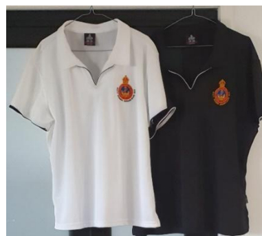
AUSSIE PACIFIC POLO SHIRT with EMBROIDERY on right side