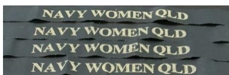
^ TALLY BAND