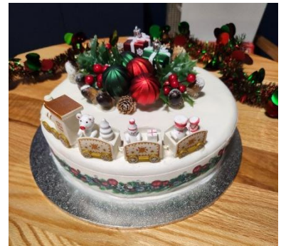
Thanks for another amazing cake