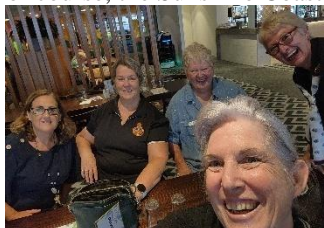
Navy Women enjoying lunch in January

It was a great morning with ladies from the Caboolture/Bribie Island area, southern suburbs of Brisbane and, of course, the Sunshine Coast.