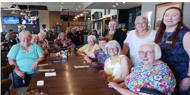
Our Caboolture ladies Feb lunch at Club Tavern