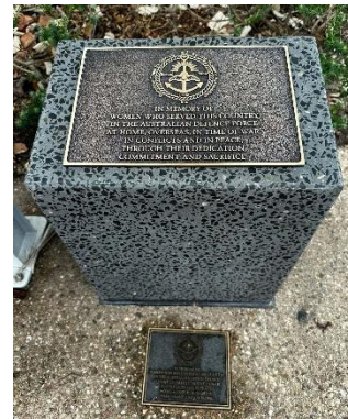
New large plinth behind the original plaque.