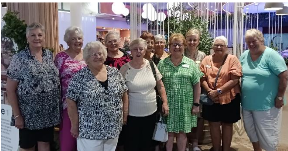
Good turnout of the ladies at Caboolture on 16 Jan

Our Navy, Army and Air Force sisters will be meeting there until the renovations are finished. There is usually about twelve to fifteen ladies from the three services in attendance. All are very welcome.