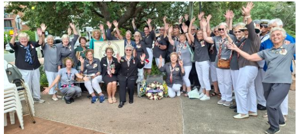
A big cheer from the Sunny Coast group at the unveiling of the new plinth, and below a more formal photo