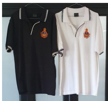
POLO SHIRTS with EMBROIDERY on right side