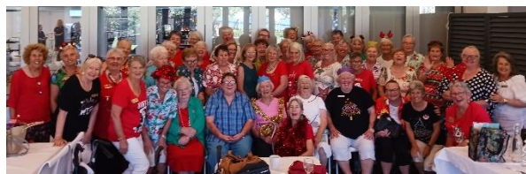
December meeting – Christmas party

The Sunny Coast ladies had their Christmas lunch at Kawana Surf Club with a good turnout from all three services. A fun time was had by all. January saw the ladies meeting at Maroochydore for the first C&C for the year Approximately thirty ladies attended