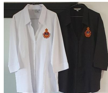
BIZ OASIS button front SHIRT with EMBROIDERY on right side

Orders for shirts and name tags take 3 weeks. Payment must be received before orders are placed.